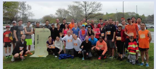
Chestnut Hill 5k ATASK racers