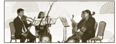
Longwood Symphony Orchestra musicians at the Silk Road Gala.

Save the date of Saturday, May 1, 2010! The Longwood Symphony Orchestra (LSO) will be performing at Jordan Hall to benefit ATASK. The LSO is a Boston-based ensemble whose musicians are also medical professionals dedicated to Healing the Community through Music. ATASK is honored to be one of the LSO's four community partners for the 2009–10 season.