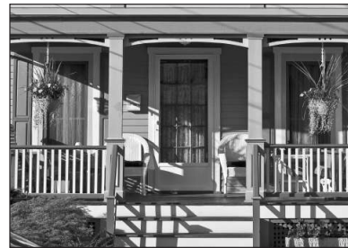
Since 1993, ATASK has provided the only multicultural and multilingual shelter for Asian survivors and families in New England.

in area schools, involving 2,400 participants. In the communities we serve, ATASK outreach staff builds awareness about ATASK's services, including its multilingual 24/7 hotline. In 2008 ATASK responded to over 7,000 advocacy calls and 308 hotline calls.